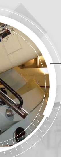
TKR to avoid vibration