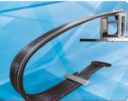
ISO Class 2 FLATVEYOR®