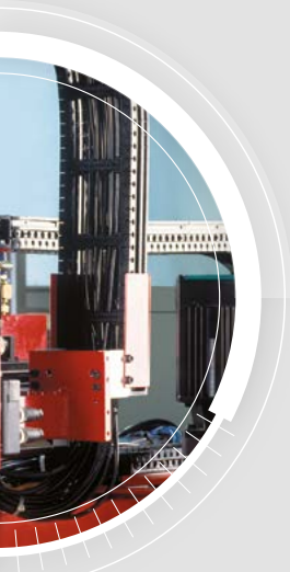
Vertical running flatveyor®

TSUBAKI KABELSCHLEPP develops customized solutions for cable carrier systems in cleanrooms. Our decades of experience from hundreds of realized projects in various industries with diverse demands on our cable carrier systems, lead to new custom and application-specific solutions for our customers. Our specialists will support you from the planning and design stage through to the onsite installation and start-up of the tested complete system.