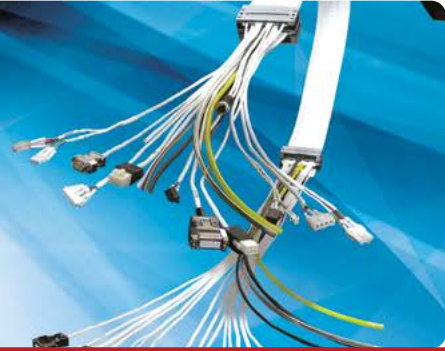
ISO Class 1 CLEANVEYOR®