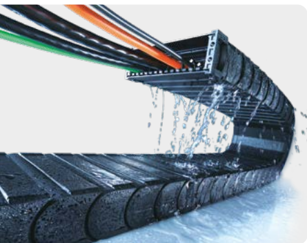
IP Class 54* TKA