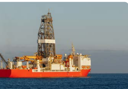
Radial rotation support for big hoses on offshore support vessel