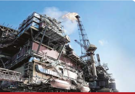
Steel cable carrier installed on an oil platform