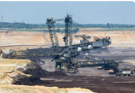
Steel cable carrier in circular application on wide-bucket coal excavator