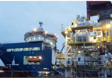
Heavy duty steel cable carrier installed with high pressure hoses on a ship