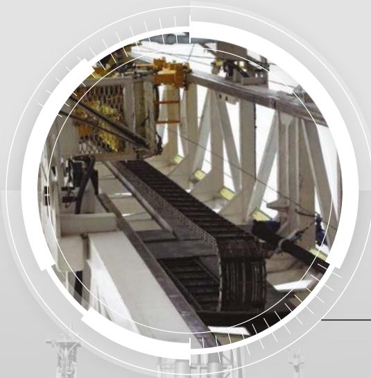
Platform rig module skidding